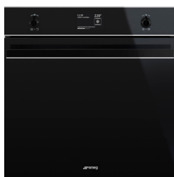
Stainless Steel Trim