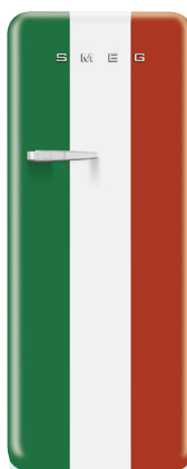
FAB28 Italian Flag RH | FAB28RDIT3 LH | FAB28LDIT3