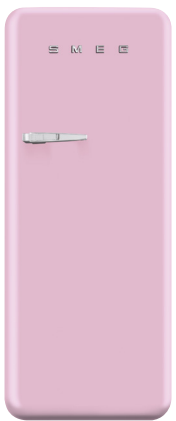
FAB28 Pink RH | FAB28RPK3 LH | FAB28LPK3