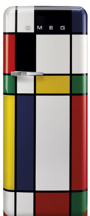
FAB28 Multicolor RH | FAB28RDMC3 LH | FAB28LDMC3