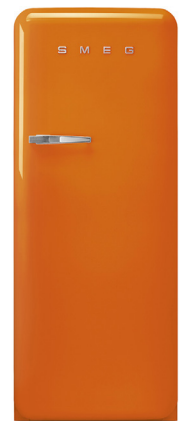
FAB28 Orange RH | FAB28ROR3 LH | FAB28LOR3