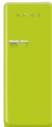
FAB28 Lime Green RH | FAB28RLI3 LH | FAB28LLI3