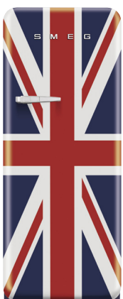
FAB28 Union Jack RH | FAB28RDUJ3 LH | FAB28LDUJ3