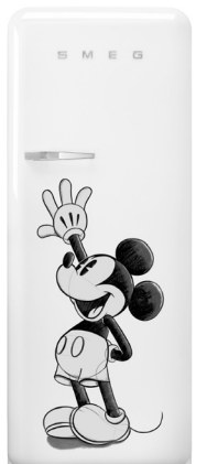
FAB28 Mikey Mouse RH | FAB28RDM4 LH | FAB28LDM4