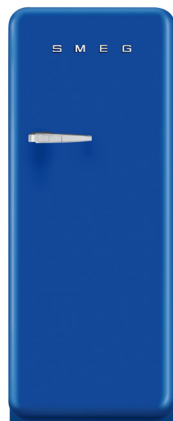
FAB28 Royal Blue RH | FAB28RBE3 LH | FAB28LBE3