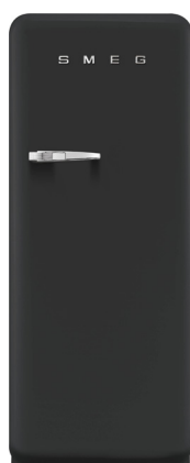
FAB28 Velvet RH | FAB28RDBLV3 LH | FAB28LDBLV3