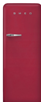
FAB28 Ruby Red RH | FAB28RDRB3 LH | FAB28LDRB3