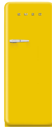
FAB28 Yellow RH | FAB28RYW3 LH | FAB28LYW3