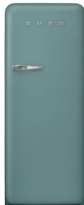
FAB28 Emerald Green RH | FAB28RDE3 LH | FAB28LDE3