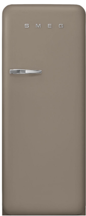
FAB28 Taupe RH | FAB28RDT3 LH | FAB28LDT3