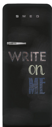
FAB28 Black Board RH | FAB28RDBB3 LH | FAB28LDBB3