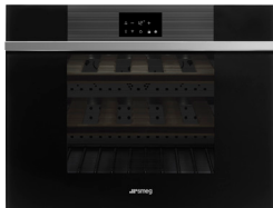
CVIA118RN2 Black Right Hinge