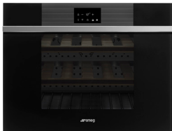
CVIA118LN2 Black Left Hinge