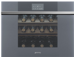
CVIA118LS2 Silver Left Hinge