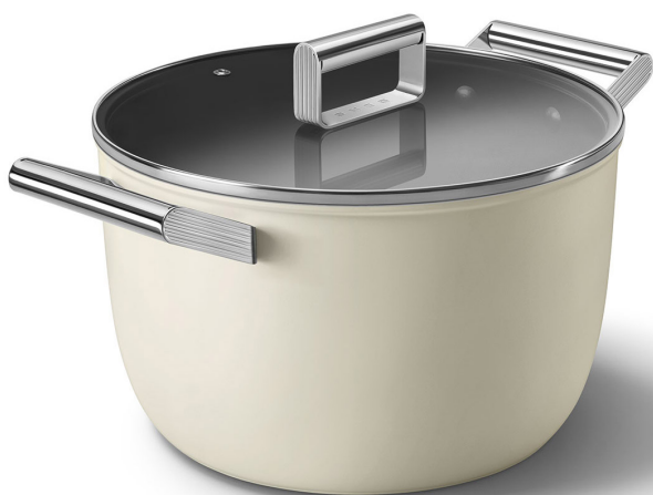
26cm Casserole Dish CKFC2611